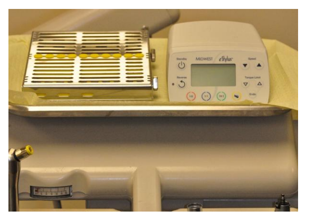
Figure 1. Operatory tray with control box on the tray (right).

During the first 3 years of the electrical technology implementation at the SODM, frequent but anecdotal feedback has been provided by students regarding the ergonomics of the system, frequent need for technical maintenance, and the clinical setting not being user-friendly for employment of the electrical technology. A common complaint was that control boxes required for operation of the electric handpieces were not secured and that the students were required to connect and disconnect them several times a day. Another concern was that the control box is bulky and occupies a large portion of the operatory tray (Figure 1).<sup>28</sup>